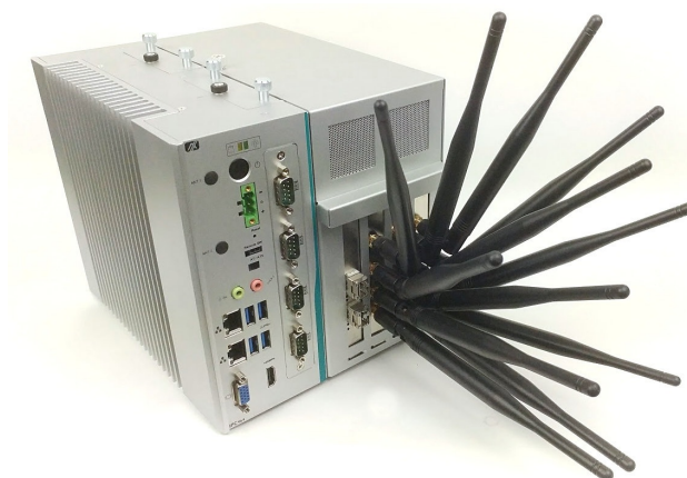
Larger Images: With Antennas No Antennas

NOTE: This product may have a different hardware configuration than the system pictured above.