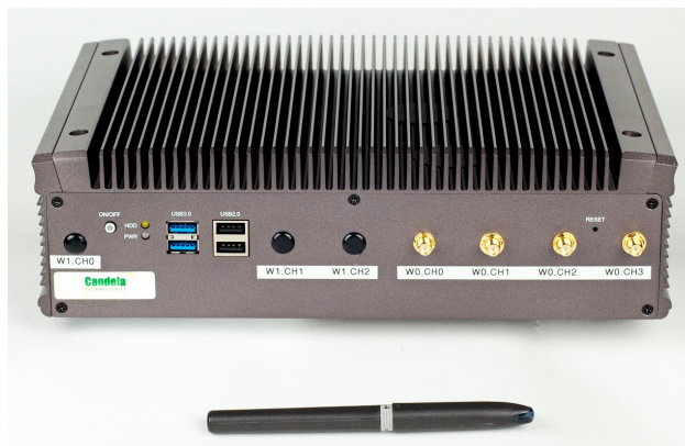
Larger Images: front back

TCP-DL-30sta-open wave-1 3x3 | TCP-DL-30sta-wpa2 wave-1 3x3