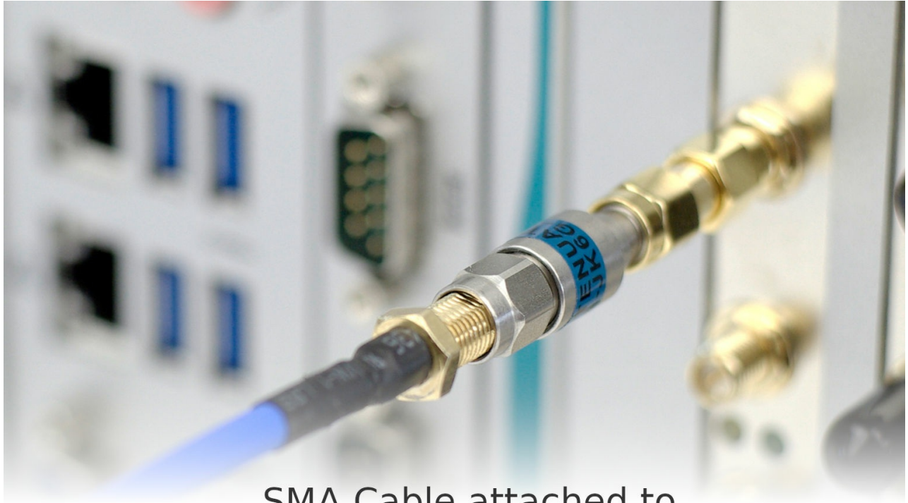
SMA Cable attached to attenuator connected to LANforge