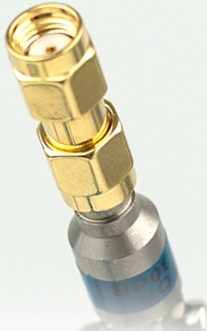
RP-SMA-Male Adapter on top