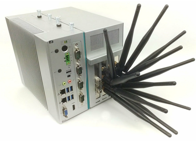
Larger Images: With Antennas No Antennas